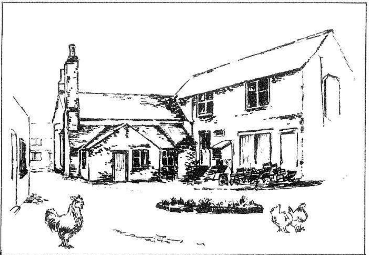
The Old Crown, Moat Street, Wigston Magna.